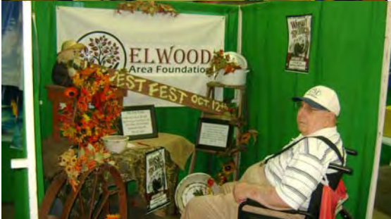
Residents enjoyed a trip to the County Fair on Friday, August 2 nd . The outing ended with a piece of pie. Thanks to everyone who helped get the residents to the fair.