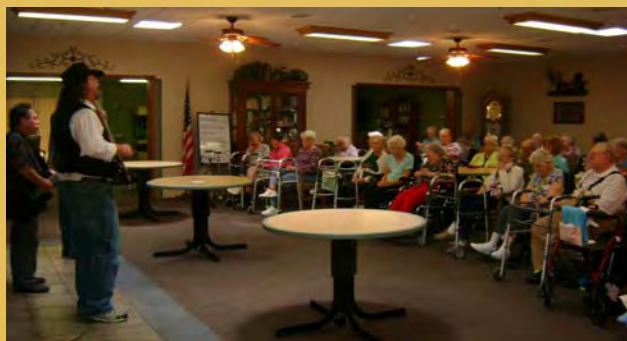
Sweetwater Band came to the Gosper County Fair. They took time to stop by the Care Center on the afternoon of August 1 st to play and sing for the residents. Thank you guys!!!

Honor grandparents. Give grandparents an opportunity to show love for their children's children. Help children become aware of the strength, information and guidance older people can offer.