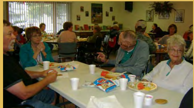
The Annual Family Picnic was held on August 7 th . We would also like to thank everyone who helped set up, serve and clean up. It was very much appreciated.